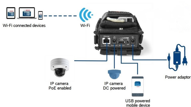
Portable camera installation tool interface