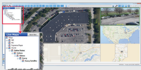
exacqVision VMS Software