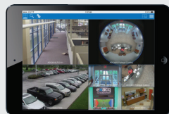
Exacq Mobile App