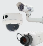
Illustra IP Cameras